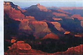
View the spectacular Grand Canyon