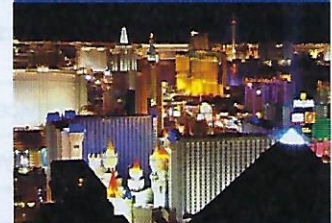
The world-famous Las Vegas Strip