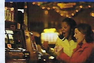
World-class Gaming and Excitement